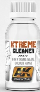
AK470 XTREME CLEANER